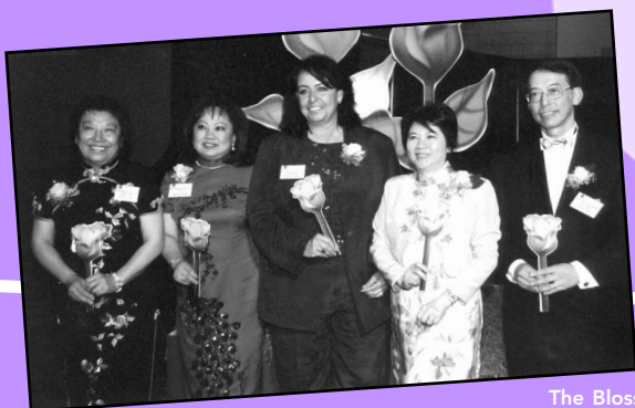
The Blossom Ball, organized by the Chinese community, attracts 900 people in support of United Way

A.T. Kearney AGF Management Limited AIM Trimark Investments Altamira Financial Services Inc. AON Consulting Aventis Pasteur Limited BearingPoint LP The Caldwell Partners International Canada Customs and Revenue Agency – Toronto Centre TSO * Canadian Pacific Railway Centre for Addiction and Mental Health Chubb Insurance Company of Canada Cisco Systems Canada Co. Citibank Canada Colgate-Palmolive Canada Inc. Corus Entertainment Inc. Costco Wholesale Davis + Henderson, L. P. Deloitte Consulting Department of Justice – Ontario Region * Direct Energy, Essential Home Services * Dundee Bancorp Inc. EdgeStone Capital Partners Inc. Eli Lilly Canada Inc. FCB Canada Ltd. Fidelity Investments Canada Limited Fraser Milner Casgrain LLP George Brown College of Applied Arts & Technology Gluskin Sheff and Associates Inc. GO Transit Goodmans LLP Government of Ontario Retired Employees * Gowling Lafleur Henderson LLP H.J. Heinz Company of Canada Ltd. Hallmark Canada